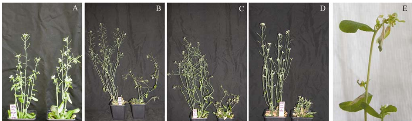
Fig. 1. Various degrees of symptom severity in the Columbia × Landsberg erecta recombinant inbred line population. Similar phenotypes were observed in the Cape Verde islands × Ler population. Healthy plants are on the left of each picture and inoculated plants, on the right. A , Plants exhibiting symptoms scoring 1, one floral hamp with top incurvation, B , plants showing symptoms scoring 2, a majority of the floral hamp are curved but no or very low reduction size, C , plants showing a phenotype scored 3 with all hamp presenting incurvation and a strong reduction of their size, and D , plant corresponding to a symptom score of 4, with heavily reduced hamp development and stunted hamp. E , Details of a symptomatic floral hamp.

It should be noted that the SYMP scores are relatively stable from one experiment to another but that the ACC values can vary substantially. This variation may be a consequence of