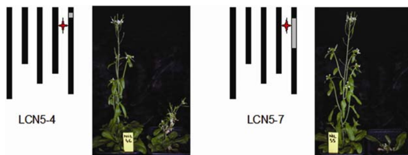
Fig. 5. Representation of two near-isogenic lines (NILs 46 and 55) showing chromosome 5 Cape Verde islands-1 introgressions (in gray) in a Landsberg erecta background (in black) and their phenotypic responses to Plum pox virus Rankovic infection. For each NIL, healthy plants are on the left and infected plants on the right. The red star indicates the approximate quantitative trait loci position on chromosome 5.

A first one is that the phenotyping strategy used did not allow a sufficiently precise and reproducible evaluation of the quantitative traits under study. In this context, it is noteworthy that the large-scale evaluation of the Col and Cvi parents showed significant plant-to-plant variability, in particular for the ACC trait, as indicated by the large standard deviations obtained. Moreover, from one experiment to another, substantial variations in ACC values were observed for the parental lines.