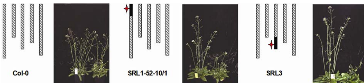
Fig. 4. Representation of two near-isogenic lines (SRL 1-52-10/1 and SRL3) showing chromosome 1 and 3 Landsberg erecta introgressions (in black) in a Col-0 (Columbia) background (in hatched black) and their phenotypic responses to Plum pox virus Rankovic infection, compared with the Col-0 parent. Healthy plants are on the left and infected plants on the right. The red star indicates the approximate quantitative trait loci positions on chromosomes 1 and 3.